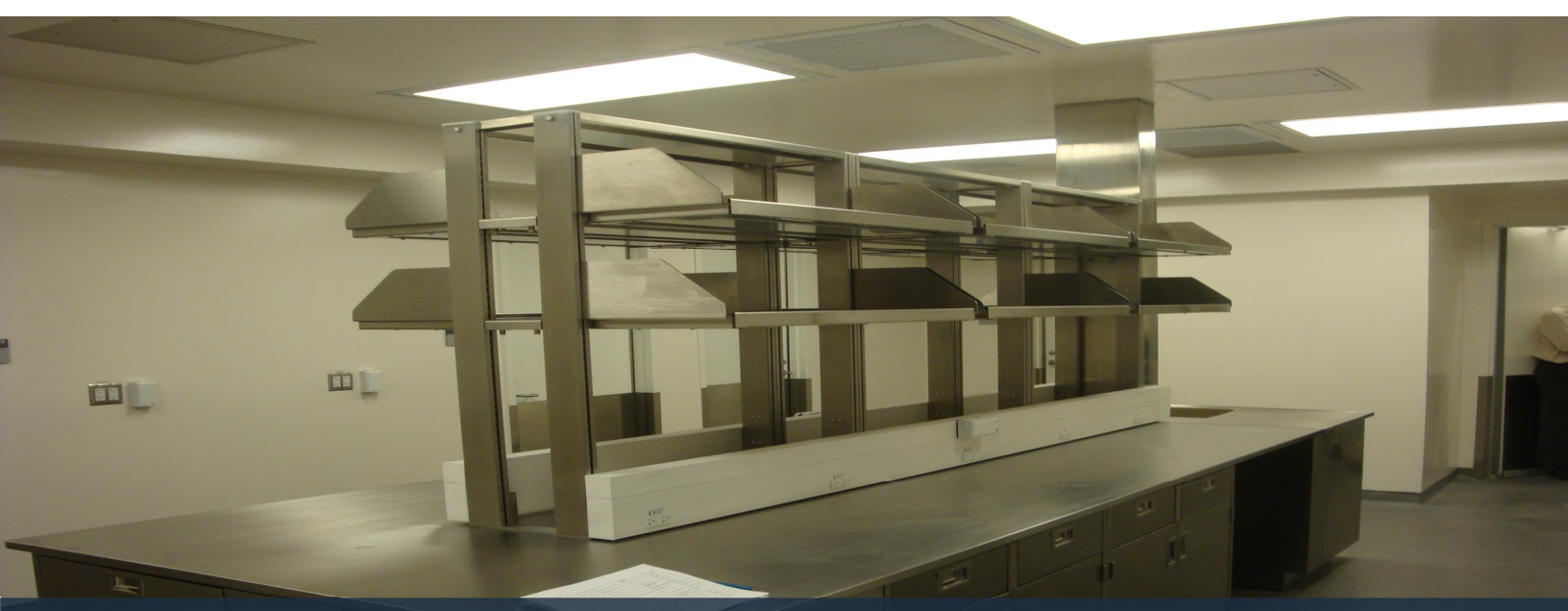
INTEGRATED CLEANROOM & LABORATORY SOLUTIONS CONTRACTOR PROFILE